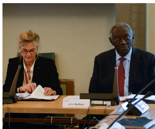
Working Group Sessions Day 2