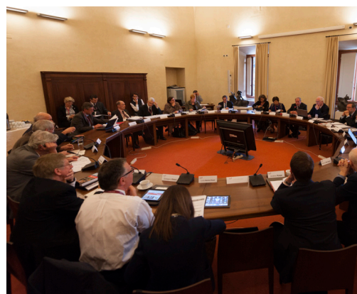
Monday November 24, 2014 - EUI Badia Fiesolana