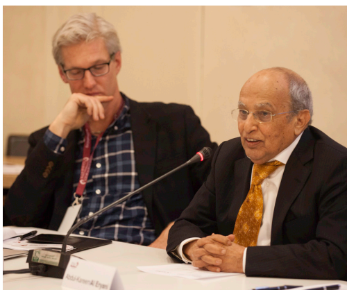
Working Group Sessions Day 1

The integration of political Islam is a prerequisite for the construction of democracy in MENA. With the vast majority of the population in these countries being Muslim, religious ideas need to be incorporated within the public space. In this regard, it is essential to find a way to separate religious structures, but not religion as such, from the State, so that legislation can be adopted by representatives of the people without a denial of religion and culture in the public space. This would of course require religious authorities to accept equality before the law and pluralism, principles that are, moreover, inherent to Islam.