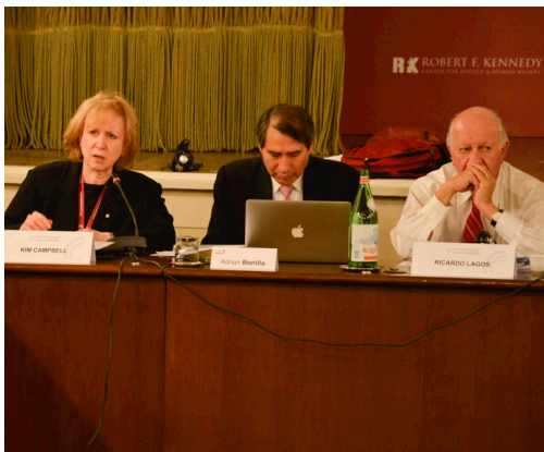
Working Group Sessions Day 1

Institutions abiding by or supporting the rule of law are not yet well established in most Latin American communities. In Central America and parts of Mexico, organized criminal groups have trampled over the judiciary and the police, and de facto rule has taken the place of elected governing bodies. Moreover, civil society continues to be comparatively weak in Latin America, while party structures are rudimentary or frail, at best. As a result, consensus-building is very difficult.