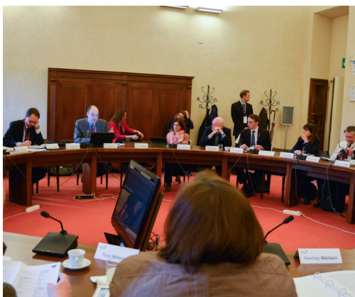
Working Group Sessions Day 1

Wider Europe (WE) and Post-Soviet Eurasia (PSE) are two vast regions with a diversity of national experiences. Democratic challenges throughout this area are distinct, and solutions need to fit varying national and regional realities; however, there is a common underlying theme that democratic systems must be updated to match new challenges, and that democratic transitions must be given new vigor if they are to be sustained.