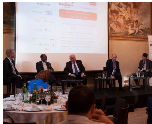
Monday November 24, 2014 - EUI Badia Fiesolana