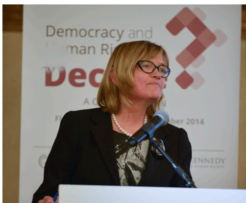
Monday November 24, 2014 - EUI Badia Fiesolana

The NGD global agenda will, on the one hand, incorporate proposals emerging from commonalities identified during the regional drafting processes and, on the other, respond to challenges and identify opportunities deriving from globalization. All Club de Madrid Members and NGD partners will actively participate in this process. A global agenda for democracy aiming at achieving the "full participation of citizens in all aspects of life", as stated in United Nations General Assembly Resolution A/62/7, must be in tune with and contribute to the work of the United Nations. In this sense, the regional and global NGD agenda must pay particular attention to the Post-2015 Development Agenda process, as well as to the various democratic development and governance initiatives being undertaken by the various United Nations' agencies, programs and related organizations, such as UNDP, with which NGD is already cooperating closely.