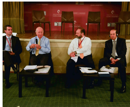
Working Group Sessions Day 2

The deterioration of democracy in the United States constitutes a main concern. There is increasing polarization within the electorate and growing indecisiveness in the federal government. Sustained inequalities and legislative dysfunctions, with elites directly influencing political action, point to fundamental deficiencies from a democratic perspective. Although the United States used to be and still is a resilient society, it is becoming increasingly disaffected and distrustful of national government. In spite of pending problems and disquieting trends, regional institutions such as the Organization of American States seem progressively less able to do their job of pointing out governments' shortfalls and exerting