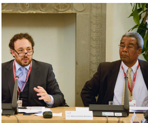
Working Group Sessions Day 1

The overall progress made in Africa and by Africans over the past three decades is the first element that must be openly recognized. While many challenges remain, there are visible signs of ongoing improvement in many sub-Saharan countries and, even if there is a strong sense that democracy is irreversible in Africa, much can be done to deepen its quality and impact on the lives of its citizens.