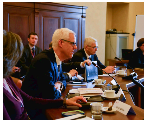
Working Group Sessions Day 2