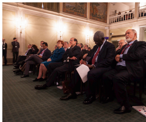
Tuesday November 25, 2014 - EUI Badia Fiesolana

and participatory democracy should in some instances complement representative democracy.