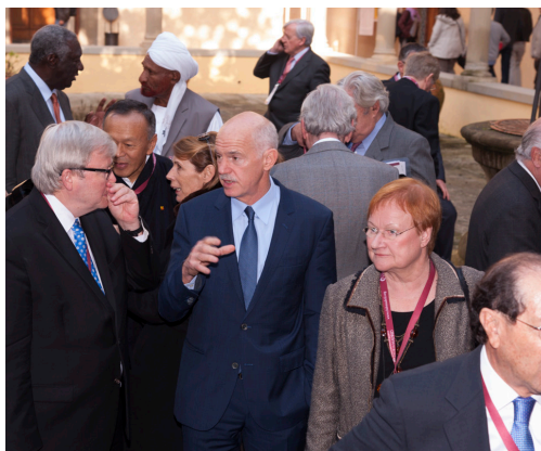
Monday November 24, 2014 - EUI Badia Fiesolana