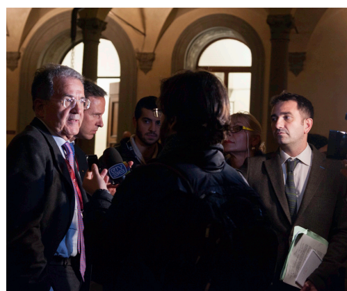
Tuesday November 25, 2014 - EUI Badia Fiesolana