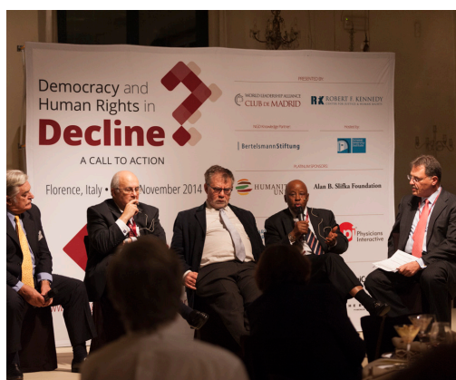
Monday November 24, 2014 - EUI Badia Fiesolana

During the second half of 2015, NGD will also undertake the drafting of a global agenda, which to a great extent will draw upon and complement the regional agendas. As agreed during the policy dialogue, the state of democracy today needs to be assessed in the context of globalization and deep interdependence. These processes tend to create constraints but may also offer opportunities to democratic actors. New technologies and social media, for example, are by definition global in scope, and thus demand a basic level of global regulation. Such activity may contribute both to enhancing public debate and increasing the transparency of policymaking at the national, regional and global levels, making national and international institutions increasingly accountable through the public information policies and open data.