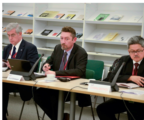
Working Group Sessions Day 2