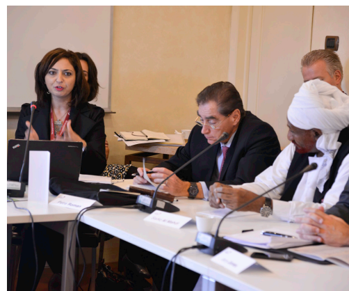
Working Group Sessions Day 2