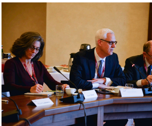
Tuesday November 25, 2014 - EUI Badia Fiesolana