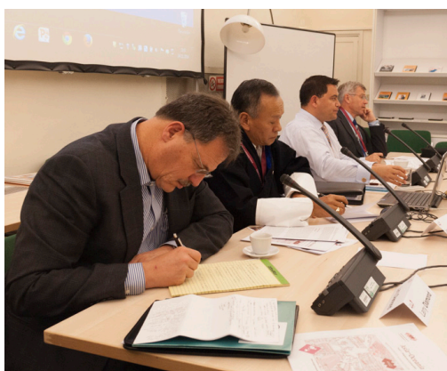
Working Group Sessions Day 1

In this context, the biggest banes for democracy in the Asia-Oceania region are populism and patronage-based politics, which flourish under the presence of state subsidies and handouts to prospective voters, despite the shortsightedness of such policies. Indeed, this trend has undermined the economies of most democracies in the region.