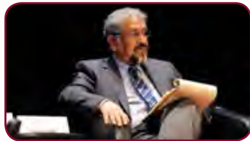
Cassam Uteem President of the Republic of Mauritius (1992-1997, 1997-2002) and Member of the Club de Madrid