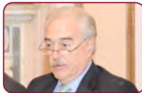
Andrés Pastrana President of Colombia, 1998-2002 and Member of the Club de Madrid

Technology can in some cases be a threat to civil liberties ; something that Club de Madrid Member Andrés Pastrana (President of Colombia, 1998-2002) illustrated very well with his anecdote on the “Assange vs. Zuckerberg dilemma”. He quipped, one gives private corporate information to the public and is declared an enemy; the other give private personal information to corporations and is the man of the year.