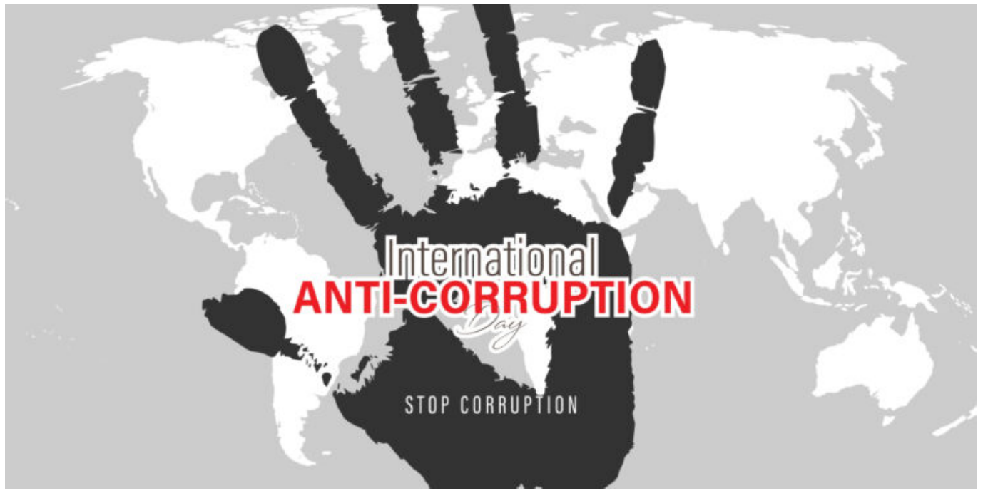
Vector Illustration for international anti-corruption day, 9 December, poster anti corruption illustration for printing

by Club de Madrid - 17 March 2023 in World