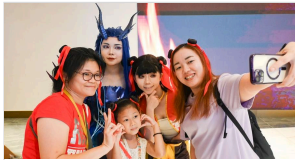
"Ne Zha 2" success showcases growing influence of Chinese culture, says...