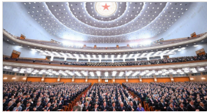
China's national legislature holds closing meeting of annual session