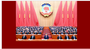
China's top political advisory body concludes annual session, vowing...