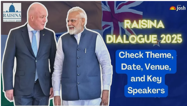
aisina Dialogue 2025: Check Theme, Agenda, Chief Guest, and Key Discussions

The Raisina Dialogue is India's premier conference on geopolitics and geoeconomics. The 2025 edition is scheduled from March 17 to 19 in New Delhi.