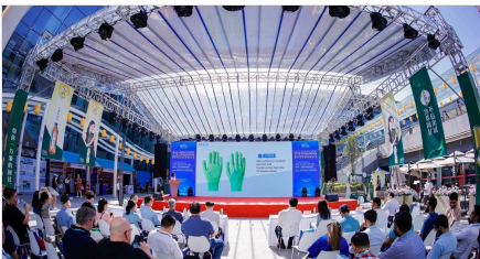
Work gloves from Maoming's Gaozhou win global buyers' favor at Canton Fair