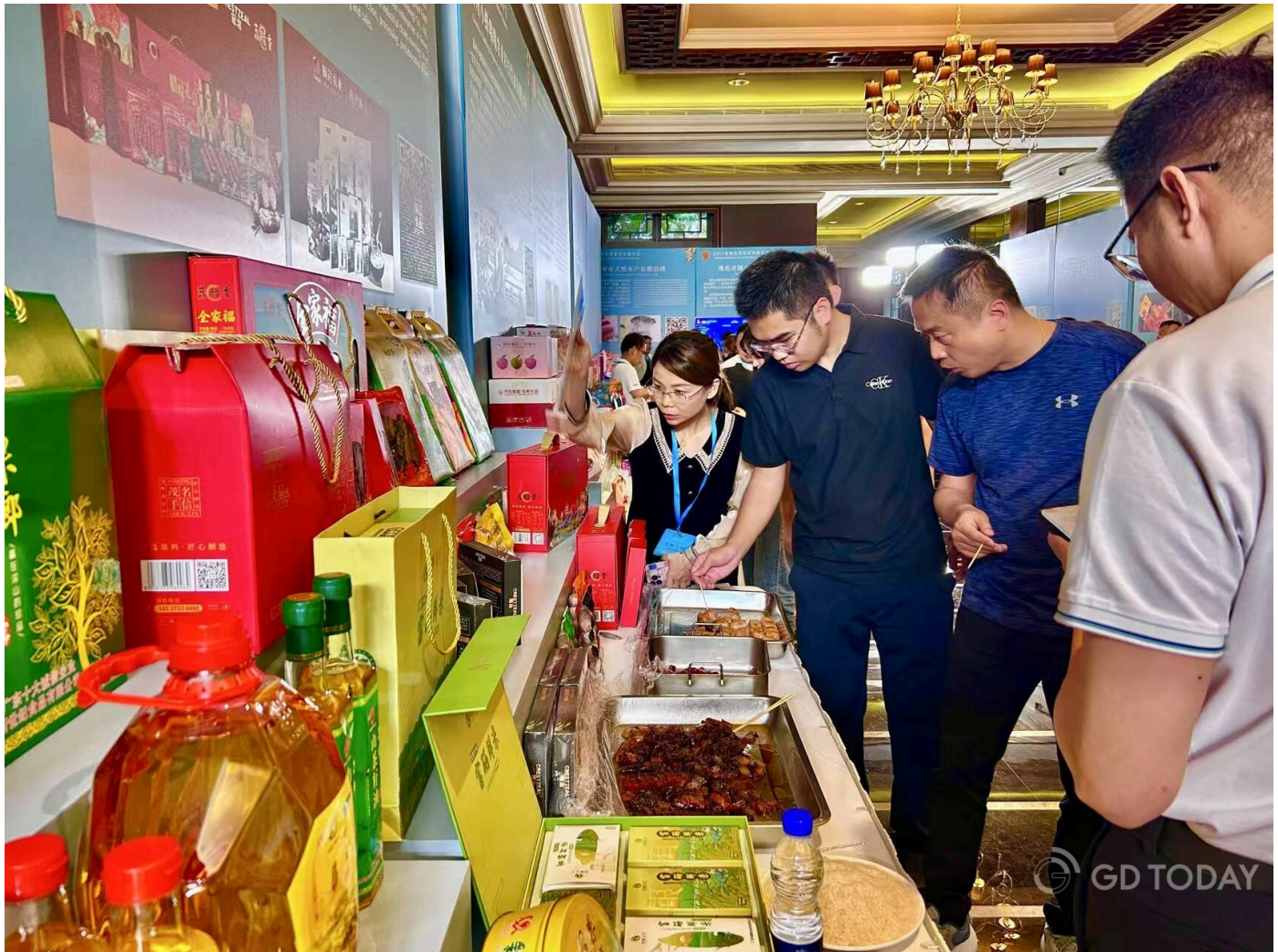
Guests sample specialty products from Maoming at 2025 Maoming Landscape and Food Culture Promotion held on April 11 in Guangzhou, the capital city of South China's Guangdong Province.

"In Guangdong, you eat well—in Maoming, you eat fresh," said Wang Xiaohui, vice mayor of Maoming, emphasizing the city's dedication to seasonal and locally sourced ingredients.