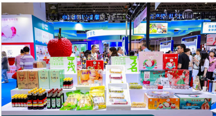
Maoming's local specialties shine at agricultural expo