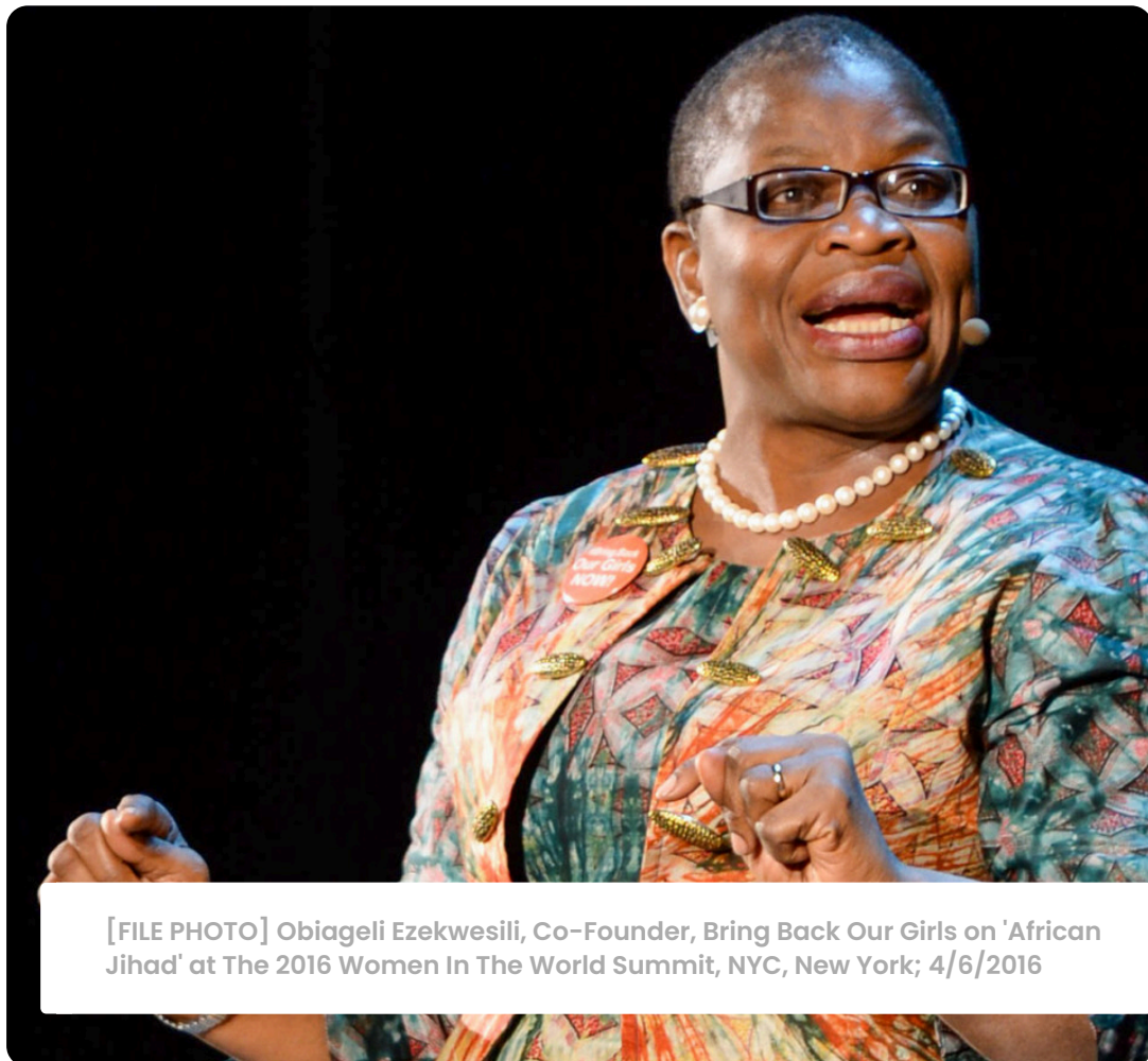
[FILE PHOTO] Obiageli Ezekwesili, Co-Founder, Bring Back Our Girls on 'African Jihad' at The 2016 Women In The World Summit, NYC, New York; 4/6/2016