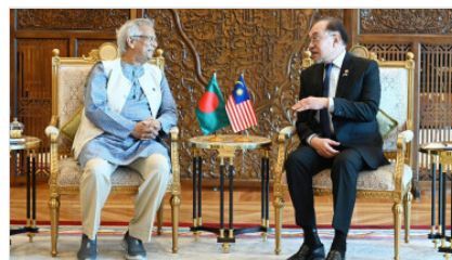
Anwar Ibrahim, Prof Yunus hold bilateral talks in Putrajaya