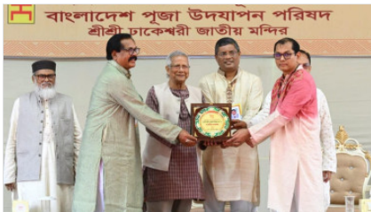
Durga Puja: Yunus says no govt can deprive citizens of basic rights