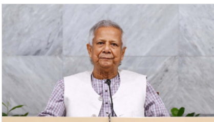
Prof Yunus to visit Cox's Bazar 25 Aug to attend dialogue on Rohingya