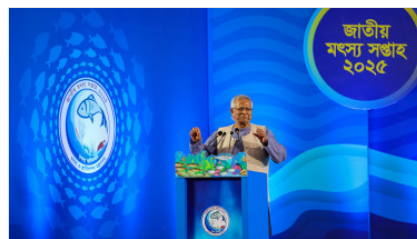
Stop poisoning river water, save fish: Yunus