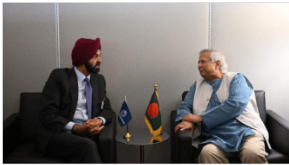
CA seeks WB help to modernise Ctg port, retrieve stolen funds