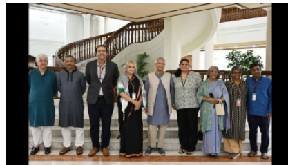
'It's our responsibility to support journey of young generation'