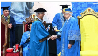
Prof Yunus honoured with UKM's Doctorate for pioneering social business